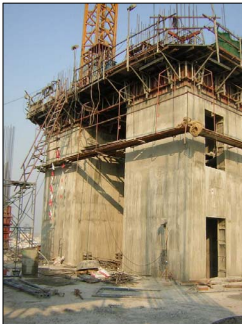
core wall and slab connection