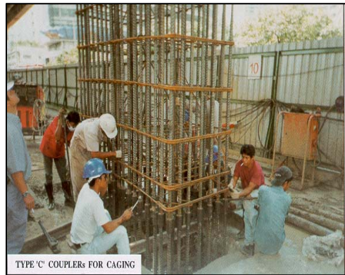
Diaphragm wall cages