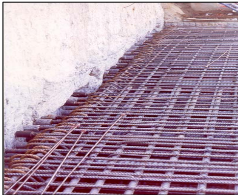
Slab connecting to D-wall